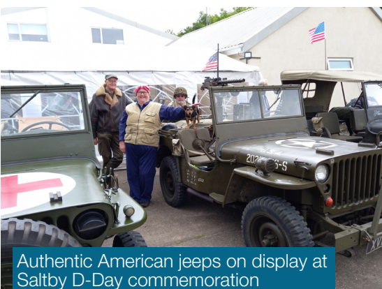
Authentic American jeeps on display at Saltby D-Day commemoration