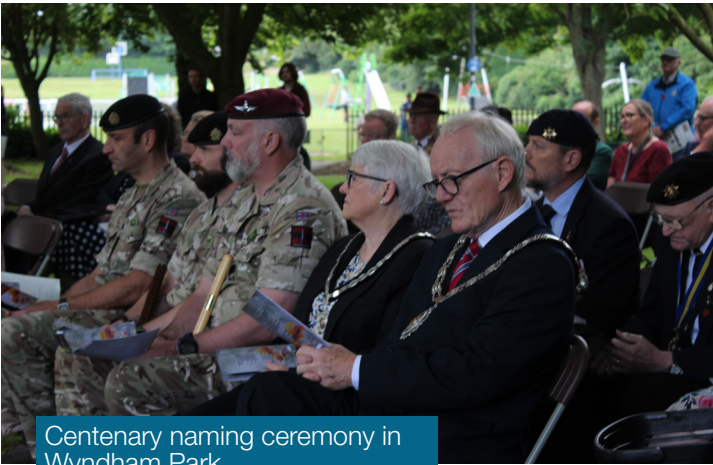
Centenary naming ceremony in Wyndham Park

Council champions from housing, revenues and benefits and cost of living attended the Veterans and Families event, a valuable networking and advice forum.