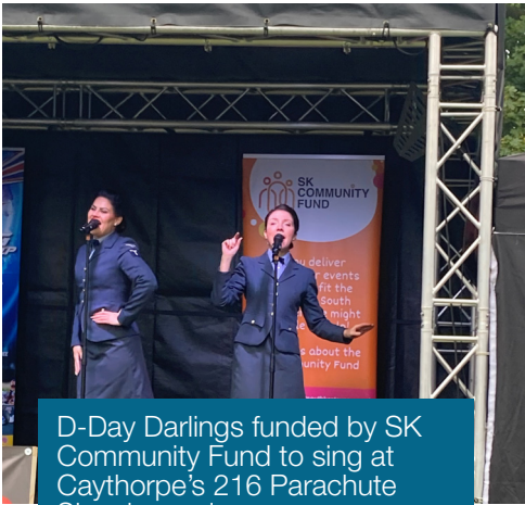
D-Day Darlings funded by SK Community Fund to sing at Caythorpe's 216 Parachute Signals reunion