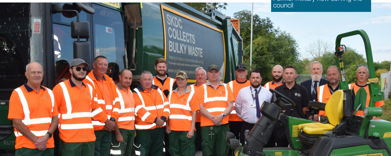
Former military now serving the council