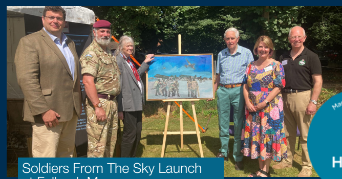
Soldiers From The Sky Launch at Fulbeck Manor