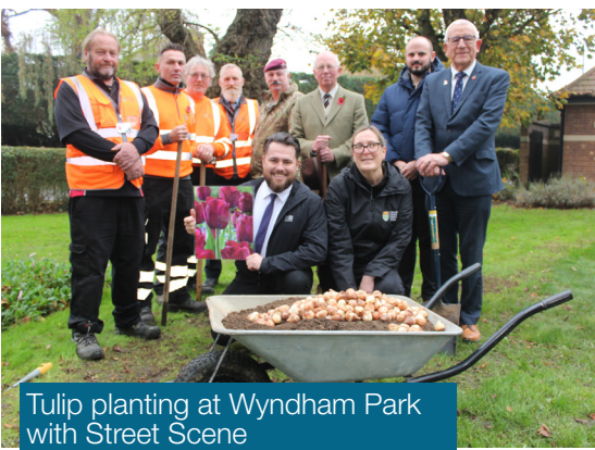
Tulip planting at Wyndham Park with Street Scene