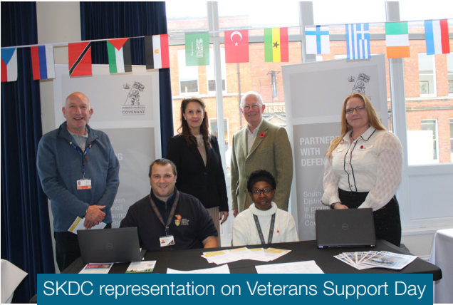
SKDC representation on Veterans Support Day