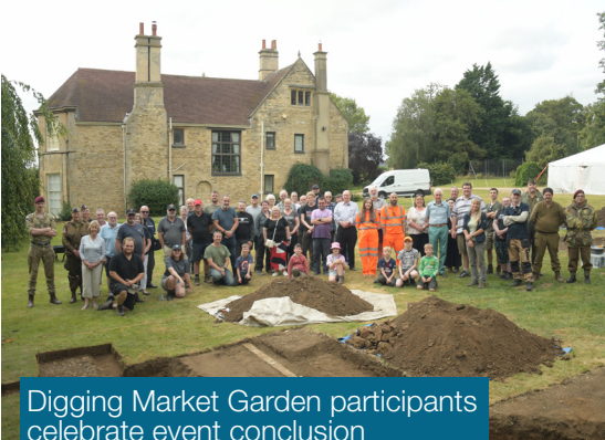
Digging Market Garden participants celebrate event conclusion