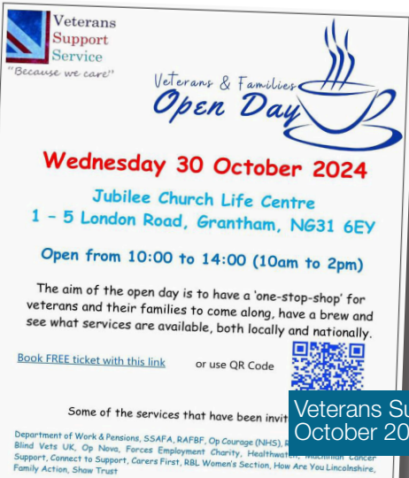
Veterans Support Day in October 2024