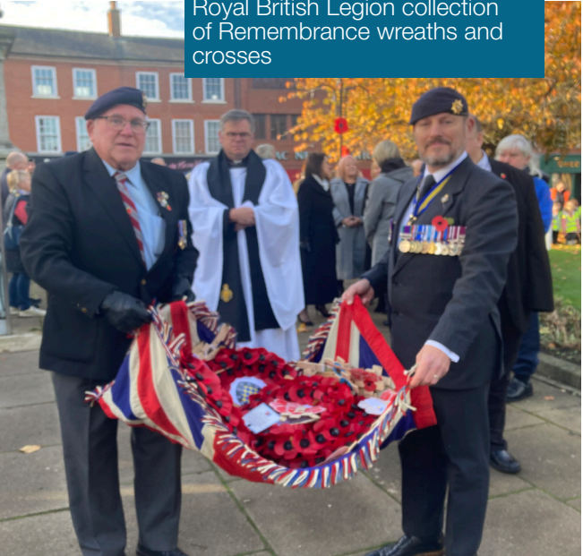
Royal British Legion collection of Remembrance wreaths and crosses